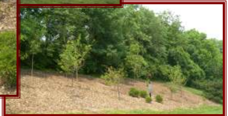
Below: Freedom Grove on Shady Cove