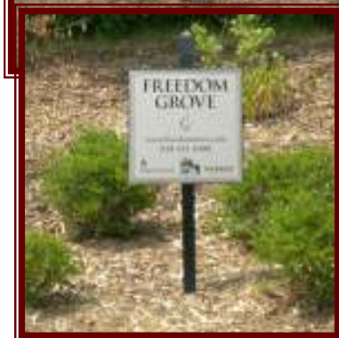
Lower Left: Signage on Shady Cove