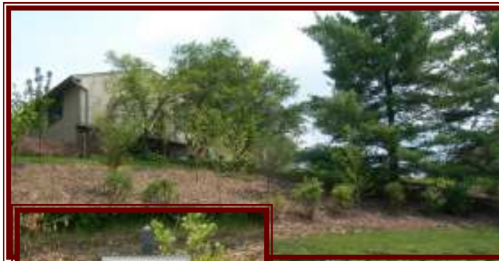
Left: Freedom Grove on Oakbrook Dive

You can learn more about this tri-state project at www.FreedomTrees.com .